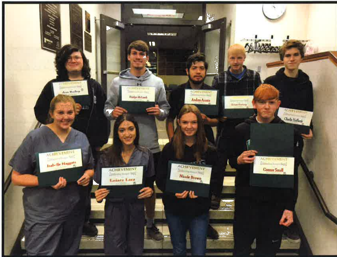
Our Morning First Quarter Stars are shown above. Our Afternoon Student Stars are shown below: