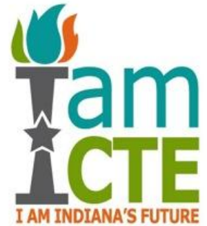
HOSA Day at Career Center