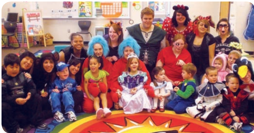
Halloween provides a chance for students, old and young, to come together at Brickie Kidz Preschool. Career and Tech Ed students work with the youngsters as part of their Education and Early Childhood Careers class.