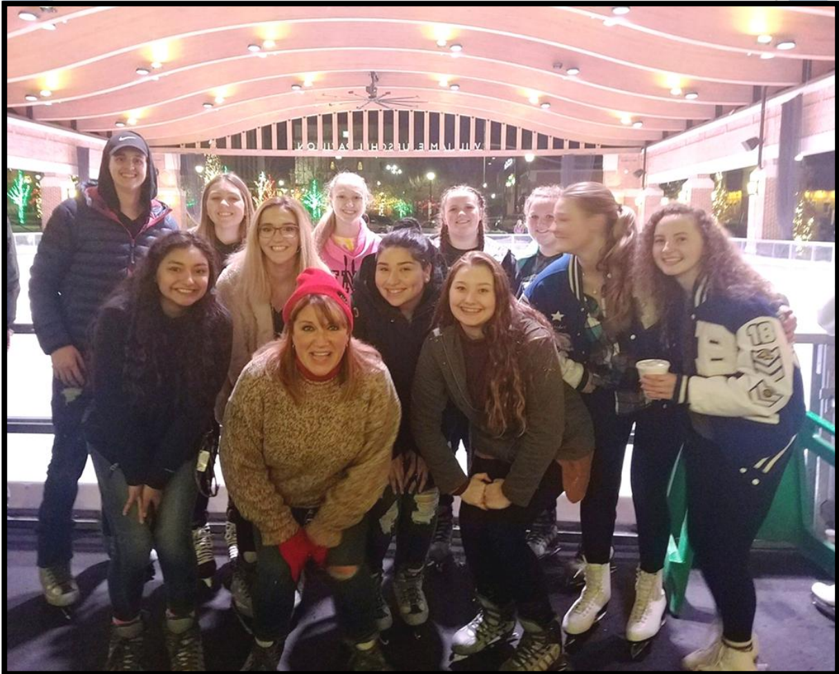
Pictured are a few of the students who attended our Skating Party.