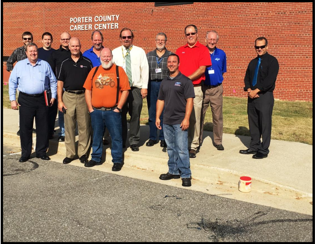
Several local employers and former students showed up to christen the start of construction for our new Precision Machining laboratory.