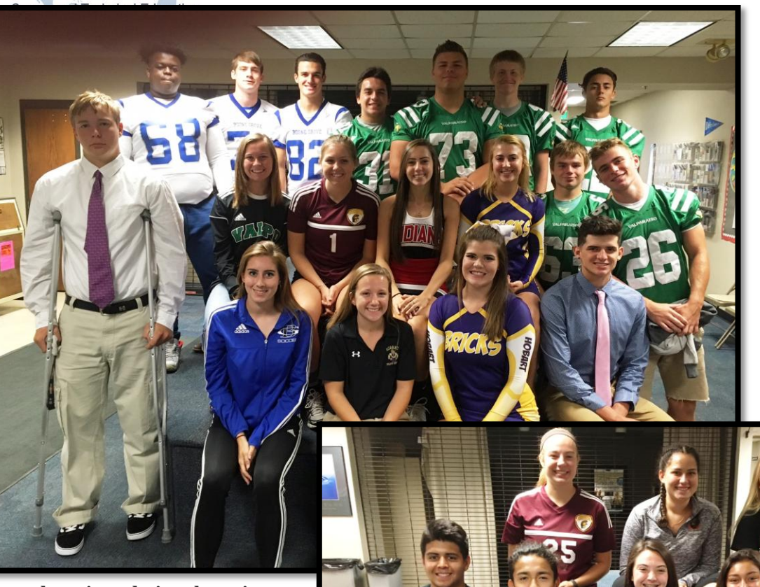
PORTER COUNTY Career and Technical Education

"Our job includes making a profound difference in the lives of our students!" "Working Together for Every Student, Every Day" PORTER COUNTY