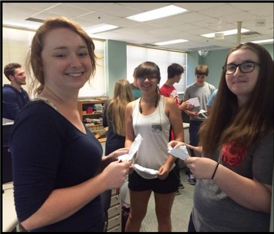
CAD students are pictured doing team building exercises in class.