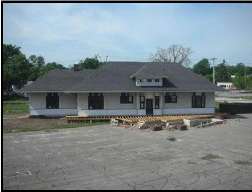
Pictured is the Depot in its present location at the Porter County Career and Tech Center. The deck being built by our students can be seen in the foreground.

ArcelorMittal has stepped forward to join our community and students in supporting the re-purposing of the 1912 Grand Trunk Railroad station with a generous donation of $50,000.