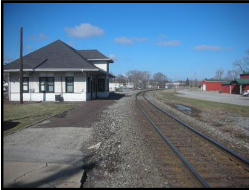
Former Location of the 1912 Grand Trunk Passenger Terminal

them with a sense of ownership of the project while also utilizing their STEM (science, technology, engineering and math) skills.”