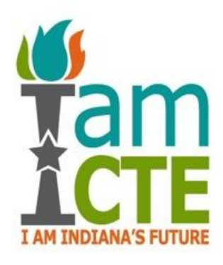
HOSA Day at Career Center