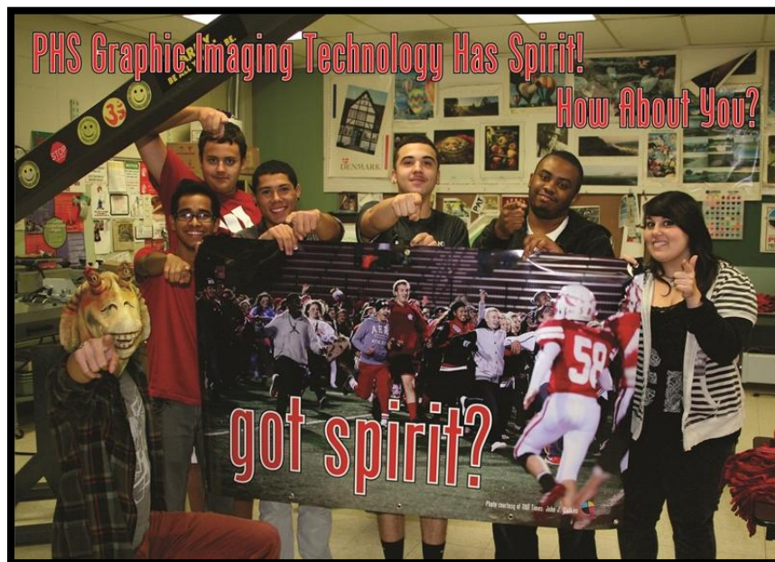
Pictured are Graphic Imaging students in Mr. Fischer's Portage program showing their spirit.