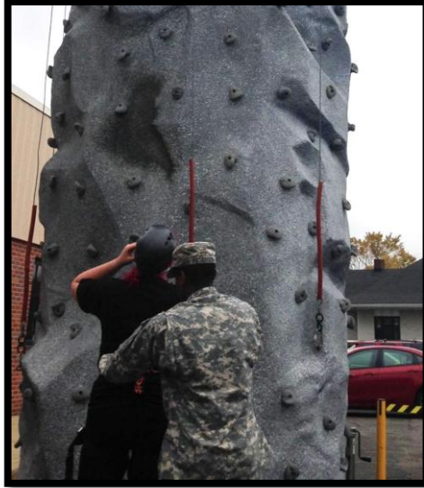
Pictured are students climbing the Army's Rock Wall at the Career and Tech Center.