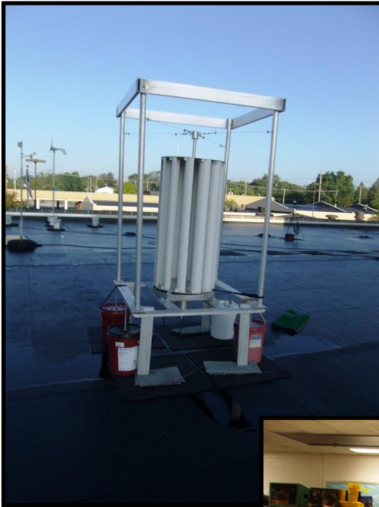
The vertical wind generator (pictured at left) is a recent addition to our rooftop alternative energy project. This design is hopefully going to be more efficient due to its ability to produce power in turbulent winds. This generator was built by our Modern Machining students and will be installed on our alternative energy grid by our Electronics students.