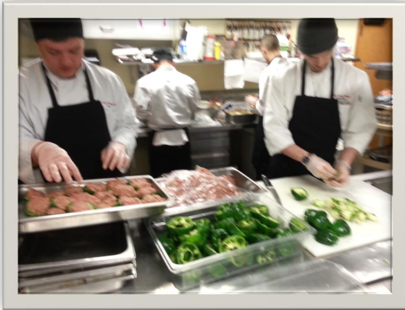
Stuffed Green Peppers being prepared by our culinary students for a Meals-on-Wheels delivery.