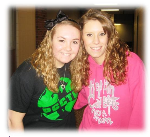
8<sup>th</sup> graders with a