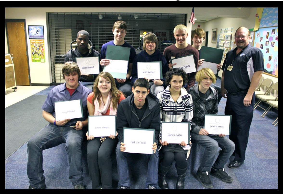
Star Career Center Morning Students