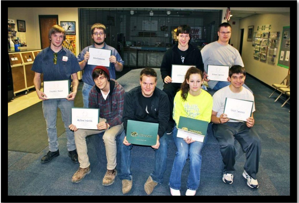
Star Afternoon Students