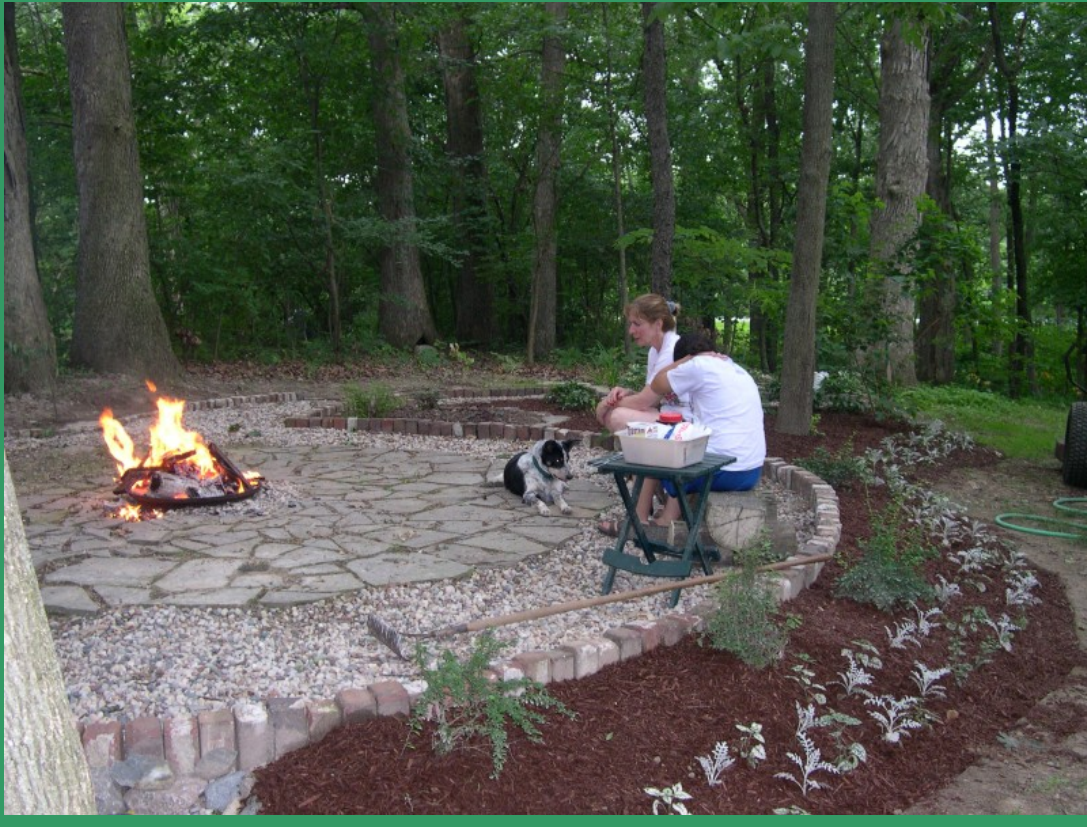
A Sample Holley's Landscaping Project

Visit their website at www.holleylawn.com